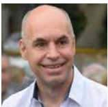
Horacio Rodríguez Larreta Mayor of City of Buenos Aires