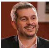
Marcos Peña Chief of the Cabinet of Ministers of Argentina