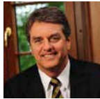
Roberto Azevedo Director General World Trade Organization