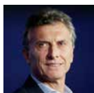
Mauricio Macri Argentine President and G20 President