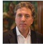
Nicolás Dujovne Argentine Minister of Treasury