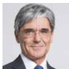
Joe Kaeser CEO Siemens