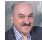
Pedro Villagra Delgado G20 Argentina Sherpa