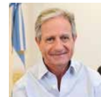
Andrés Ibarra Deputy Cabinet Chief and Secretary of Modernization of Argentina