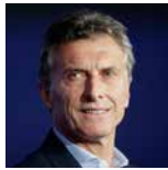
Mauricio Macri Argentine President and G20 President