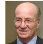
Paolo Rocca President Techint Group Chair B20 Task Force Trade and Investment