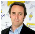
Marcos Galperin CEO Mercado Libre Chair B20 Task Force Digital Economy and Industry 4.0