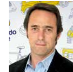
Marcos Galperín CEO Mercado Libre Chair B20 Task Force Digital Economy and Industry 4.0