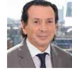
Dante Sica Argentine Minister of Production and Labour