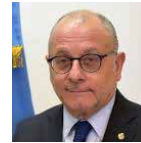
Jorge Faurie Argentine Minister of Foreign Affairs and Worship